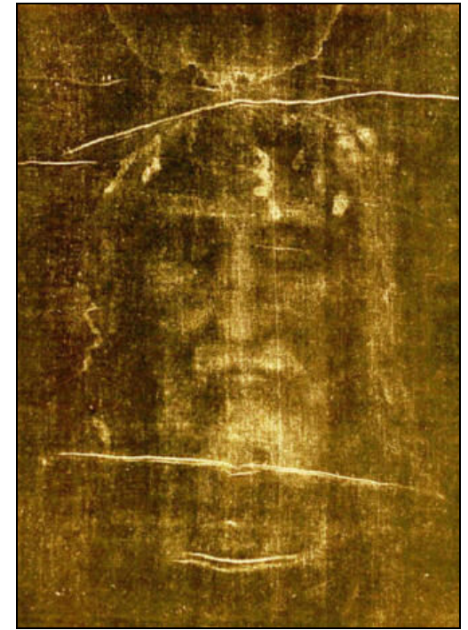
Photographic negative of the face on the Shroud of Turin

The Shroud (burial garment) is a single piece of linen cloth about 14 feet long by 3½ feet wide. The twill is a 3 over 1 herringbone weave. It is blood-stained and shows faint front and back images of a man who, by the visible wounds appears to have been crucified. He seems to be resting in burial repose.